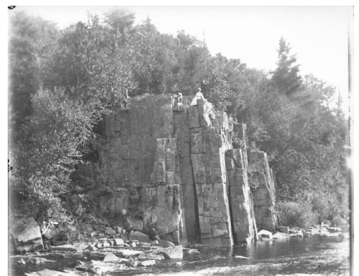
The Dells of Eau Claire