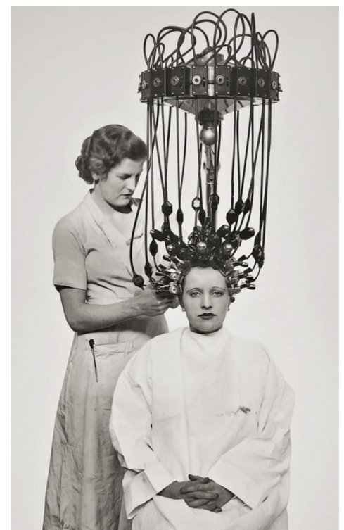
Right: A woman getting her hair set in a permanent wave machine.