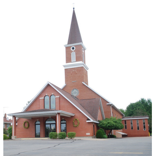
St. Ladislaus Catholic Church

Enjoy the trip. Explore other Marathon County historical sites that detail the broad fabric of the county's past. The Marathon County Historical Society can help.